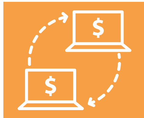
Donor Advised Fund