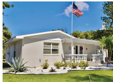
Warrior Homes of Collier Bravo House

For many veterans, the transition home is not easy. The challenges of re-entering civilian life can begin immediately—navigating a new routine, finding work, and adjusting to life beyond service. For some, those challenges deepen over time, as fixed incomes, rising costs, and unseen wounds like Post-Traumatic Stress Disorder (PTSD) make it harder to maintain a place of their own.