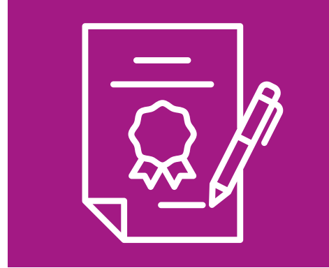
Stock or Securities