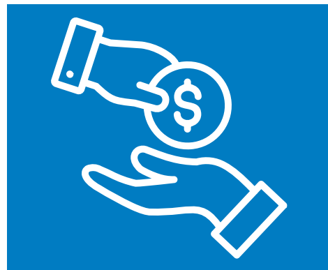
Qualified Charitable Distributions