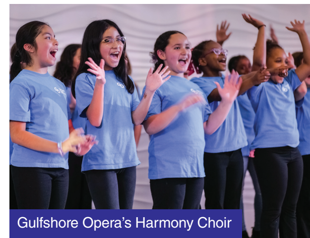
Gulfshore Opera's Harmony Choir