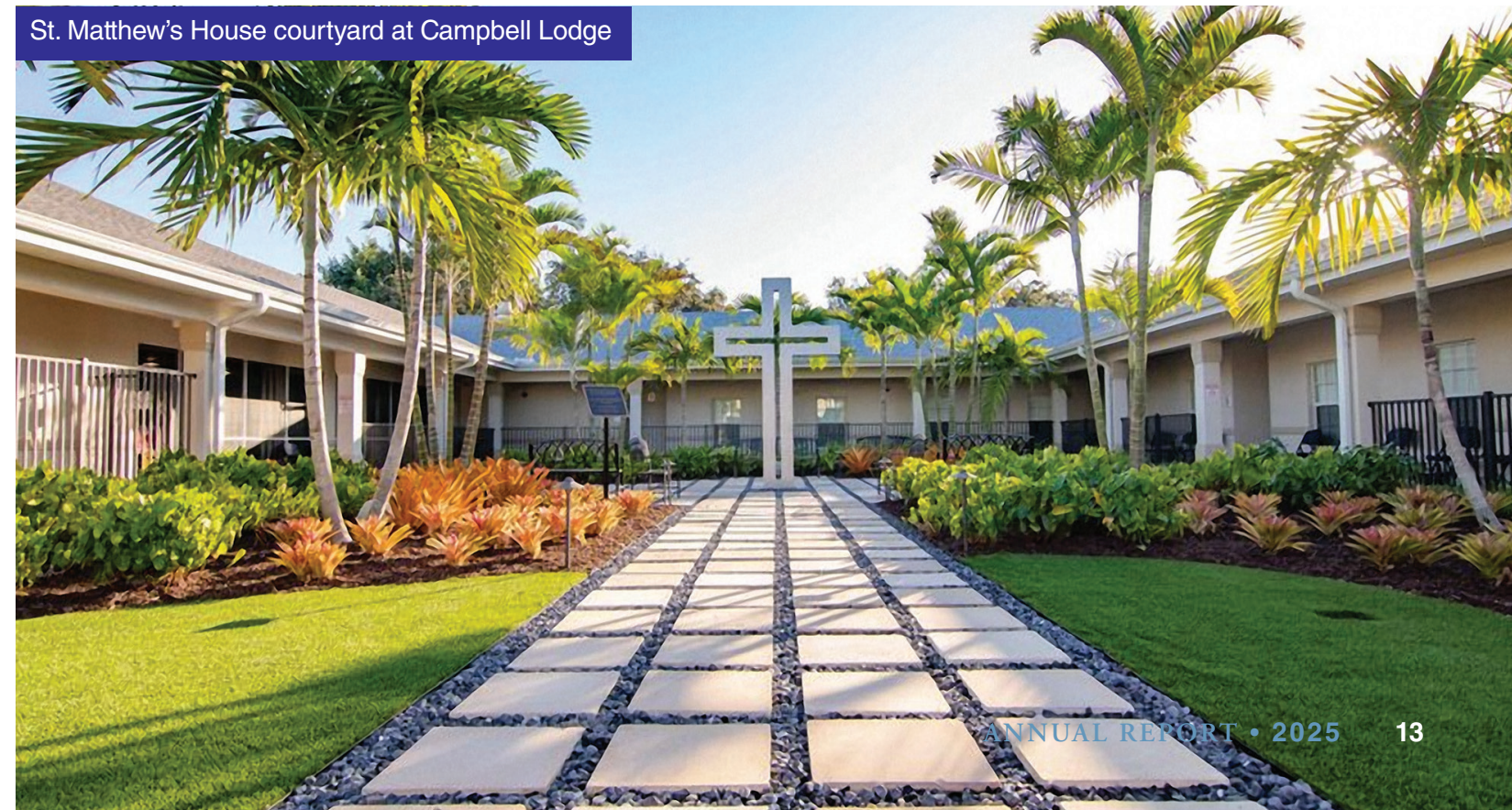
St. Matthew's House courtyard at Campbell Lodge

2025 Grant Amount: $25,000 • Total Grant History: $78,500 Rapid, affordable housing for senior veterans—offers stability, dignity, and access to mental health services and peer connection