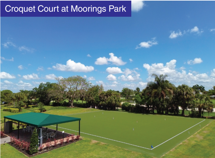
Croquet Court at Moorings Park

Perhaps most meaningfully, they are a visible reminder that this is a community where neighbors care for one another—where generosity quite literally shapes the places we call home.