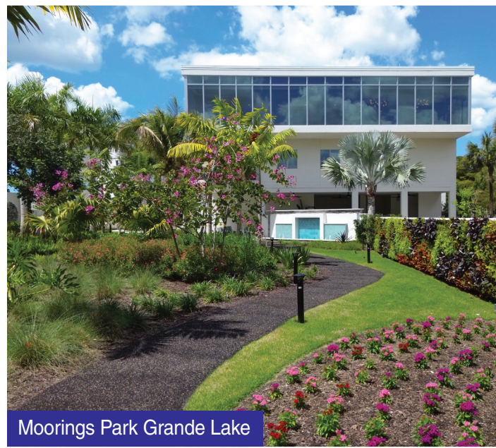
Moorings Park Grande Lake