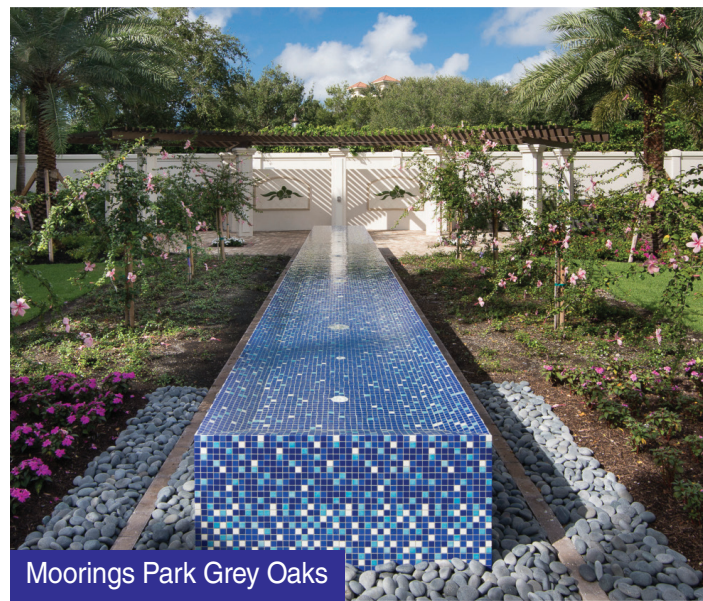
Moorings Park Grey Oaks