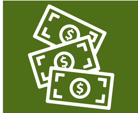
Cash or Check