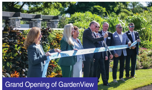
Grand Opening of GardenView

Just beyond its doors, GardenView's botanical gardens provide a relaxing and restorative retreat. Lush landscaping, tranquil pathways, and inviting gathering spaces create opportunities for reflection, connection, and renewal—enhancing daily life in meaningful ways.